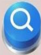
Track Your Status