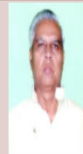
Shri Bijendra Prasad Yadav Hon'ble Minister