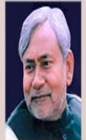
Shri Nitish Kumar Hon'ble Chief Minister

About Us ▾ Acts & Rules ▾ Notifications ▾ Tax Schedule ▾ Tax Calendar ▾ Forms ▾ RTI ▾ RTPS ▾ Help ▾