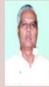
Shri Bijendra Prasad Yadav Hon'ble Minister