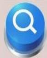
Track Your Status