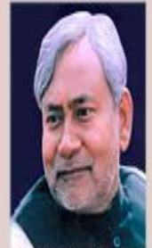
Shri Nitish Kumar Hon'ble Chief Minister

About Us ▾ Acts & Rules ▾ Notifications ▾ Tax Schedule ▾ Tax Calendar ▾ Forms ▾ RTI ▾ RTPS ▾ Help ▾