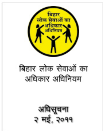
BRTPS Act, 2011

Documents related to Bihar Right to Public Services Act, 2011 (BRTPS) , as published by the Dept., can be viewed using the links given below: