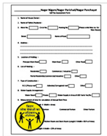
Application Form (English)