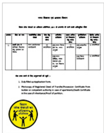
Notified Services & Checklists