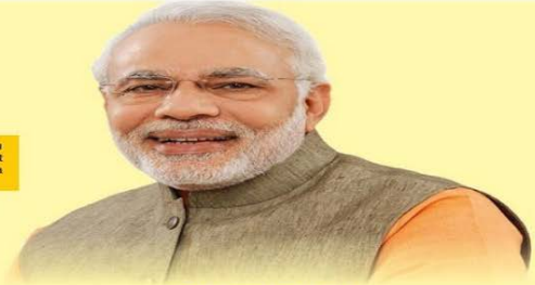
Shri Narendra Modi Hon'ble Prime Minister of India