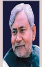
Shri Nitish Kumar Hon'ble Chief Minister

About Us ▾ Acts & Rules ▾ Notifications ▾ Tax Schedule ▾ Tax Calendar ▾ Forms ▾ RTI ▾ RTPS ▾ Help ▾