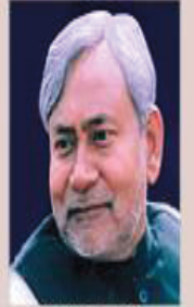
Shri Nitish Kumar Hon'ble Chief Minister