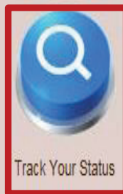
Track Your Status