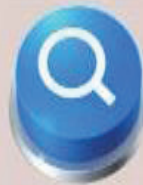
Track Your Status