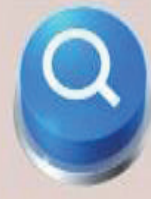
Track Your Status