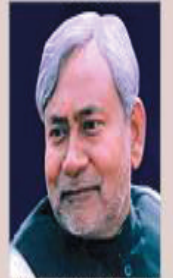
Shri Nitish Kumar Hon'ble Chief Minister

About Us ▾ Acts & Rules ▾ Notifications ▾ Tax Schedule ▾ Tax Calendar ▾ Forms ▾ RTI ▾ RTPS ▾ Help ▾