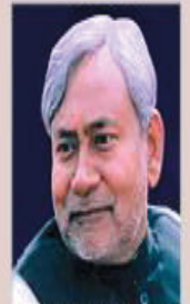
Shri Nitish Kumar Hon'ble Chief Minister