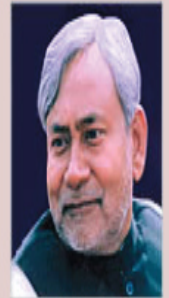
Shri Nitish Kumar Hon'ble Chief Minister

About Us ▾ Acts & Rules ▾ Notifications ▾ Tax Schedule ▾ Tax Calendar ▾ Forms ▾ RTI RTPS Help ▾