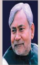
Shri Nitish Kumar Hon'ble Chief Minister

About Us ▾ Acts & Rules ▾ Notifications ▾ Tax Schedule ▾ Tax Calendar ▾ Forms ▾ RTI ▾ RTPS ▾ Help ▾