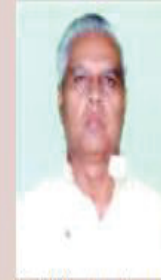
Shri Bijendra Prasad Yadav Hon'ble Minister