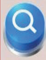
Track Your Status