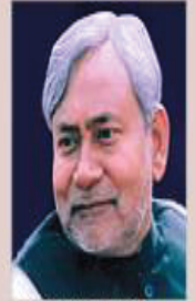
Shri Nitish Kumar Hon'ble Chief Minister