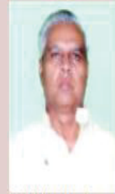
Shri Bijendra Prasad Yadav Hon'ble Minister