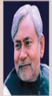
Shri Nitish Kumar Hon'ble Chief Minister