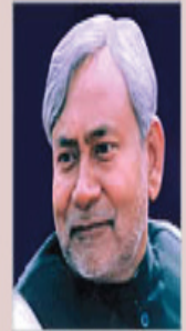
Shri Nitish Kumar Hon'ble Chief Minister

About Us ▾ Acts & Rules ▾ Notifications ▾ Tax Schedule ▾ Tax Calendar ▾ Forms ▾ RTI ▾ RTPS ▾ Help ▾