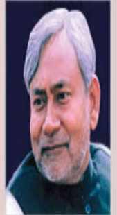
Shri Nitish Kumar Hon'ble Chief Minister

About Us ▾ Acts & Rules ▾ Notifications ▾ Tax Schedule ▾ Tax Calendar ▾ Forms ▾ RTI ▾ RTPS ▾ Help ▾