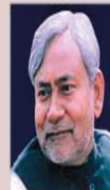
Shri Nitish Kumar Hon'ble Chief Minister

About Us ▾ Acts & Rules ▾ Notifications ▾ Tax Schedule ▾ Tax Calendar ▾ Forms ▾ RTI ▾ RTPS ▾ Help ▾