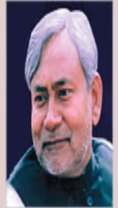
Shri Nitish Kumar Hon'ble Chief Minister

About Us ▾ Acts & Rules ▾ Notifications ▾ Tax Schedule ▾ Tax Calendar ▾ Forms ▾ RTI RTPS Help ▾