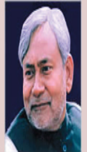
Shri Nitish Kumar Hon'ble Chief Minister

About Us ▾ Acts & Rules ▾ Notifications ▾ Tax Schedule ▾ Tax Calendar ▾ Forms ▾ RTI RTPS Help ▾