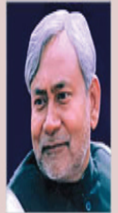
Shri Nitish Kumar Hon'ble Chief Minister