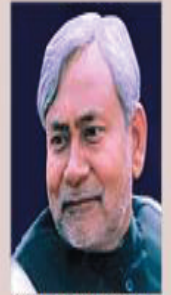
Shri Nitish Kumar Hon'ble Chief Minister