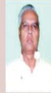
Shri Bijendra Prasad Yadav Hon'ble Minister