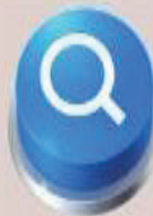
Track Your Status