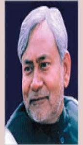
Shri Nitish Kumar Hon'ble Chief Minister

About Us ▾ Acts & Rules ▾ Notifications ▾ Tax Schedule ▾ Tax Calendar ▾ Forms ▾ RTI ▾ RTPS ▾ Help ▾