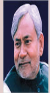
Shri Nitish Kumar Hon'ble Chief Minister