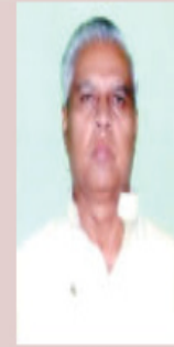
Shri Bijendra Prasad Yadav Hon'ble Minister