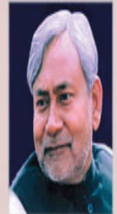
Shri Nitish Kumar Hon'ble Chief Minister

About Us ▾ Acts & Rules ▾ Notifications ▾ Tax Schedule ▾ Tax Calendar ▾ Forms ▾ RTI ▾ RTPS ▾ Help ▾